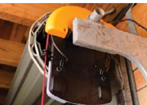
Opener with LED Courtesy Lights