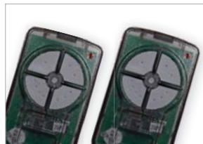
Two TrioCode™128 transmitters